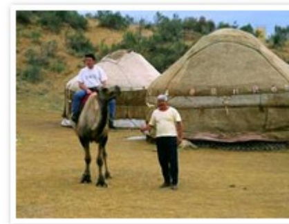
Yangi Kazgan-Desert Adventure

In brief: There are four must see cities in Uzbekistan, and this is a classical itinerary that covers all of them. With this one, you will also leave the bustle of the city behind you and experience a peaceful night in a yurt in the middle of Kyzil Kum Desert. All four cities are unique and different one from the other: Khiva is an actual open-air museum; Bukhara is rich in history and dramatic, Islamic architecture; Samarkand will give you the feel in being a part of the famous story, "1001 Nights"; Tashkent amazes everybody with its wide boulevards, green parks, and vibrant night life.